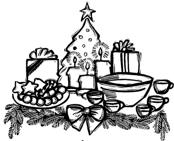
CHURCH CHRISTMAS PARTY

You're invited to the UUC Christmas Party tonight at 5pm in the King David Room of the Church Center! The Youth will host a festive evening of inspiration, Christmas carols, and a magical mystery 'White Elephant' activity.