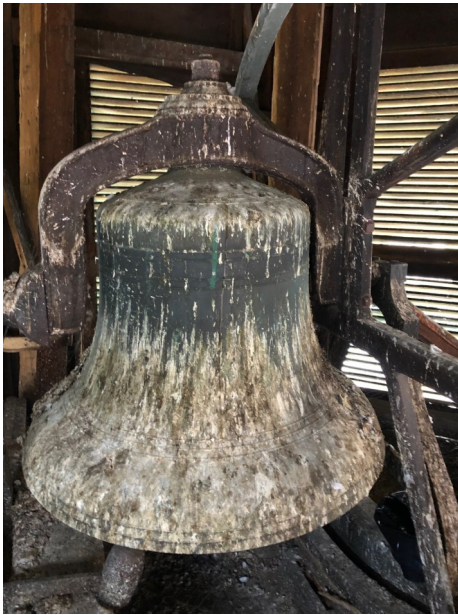
This is what happens when you have birds in the belfry.

* The front office off the foyer was cleaned out.