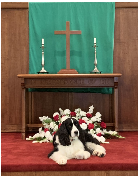
A star returns to the (new) Red Carpet!