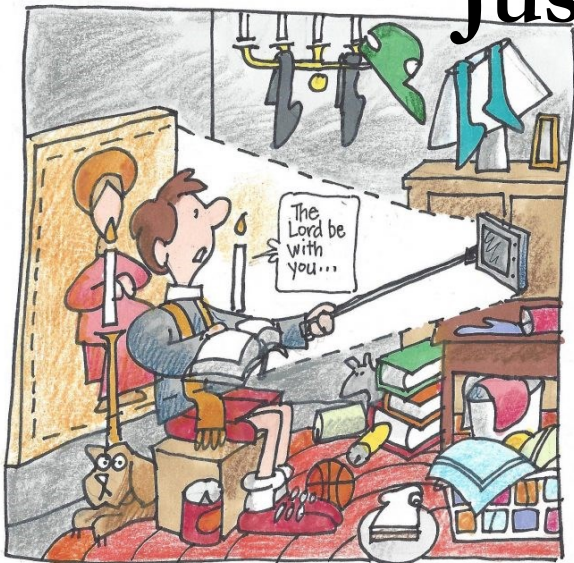
THE PRIEST CARVES OUT SACRED SPACE AT HOME IN ORDER TO RECORD LITURGY FOR SUNDAY.