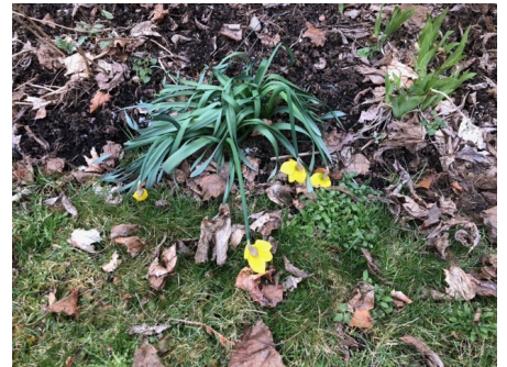
These daffys outside the Church Center aren't laughing!

April Fools' Day isn't a religious holiday, though it may date to Pope Gregory XIII and his new calendar. In 1582, he shifted New Year's Day from April to January, and people who didn't believe the change were called April fools. April Fools' Day may also be connected to the lightheartedness that comes with warmer weather, as well as to medieval Christian festivals that involved pranks, disguises and a temporarily inverted social order.